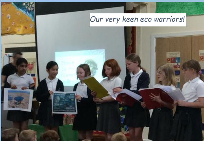
Our very keen eco warriors!